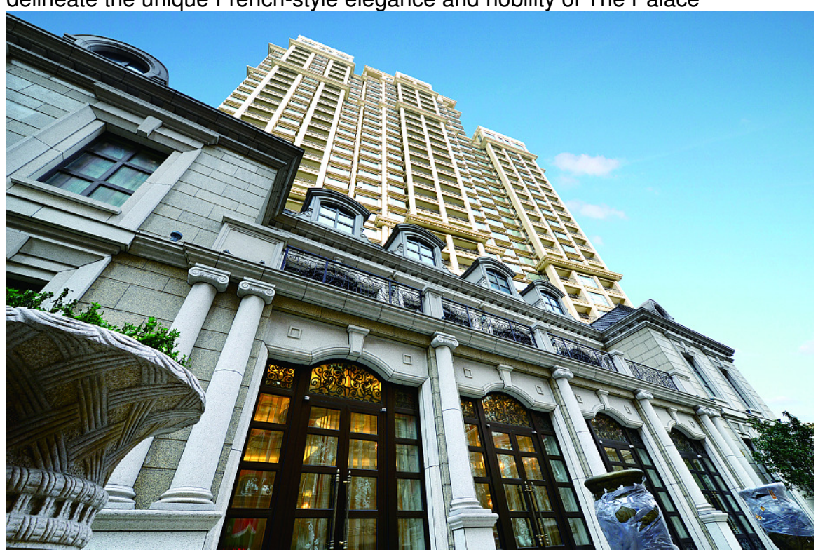
Photo 2: Residents of The Palace can enjoy high-end amenities including a grand lobby, a thermostat controlled swimming pool, private ballroom, multi-purpose entertainment room and fitness centre in Club du PALACE, designed by the world-renowned architect Steve Leung

Photo 1: The distinctive architectural lines, fine proportions, and dignified colour palate delineate the unique French-style elegance and nobility of The Palace